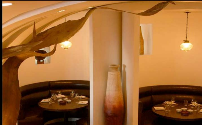
Casa - 350 South Grand Avenue, Two California Plaza, Los Angeles - T. +1 2136212249